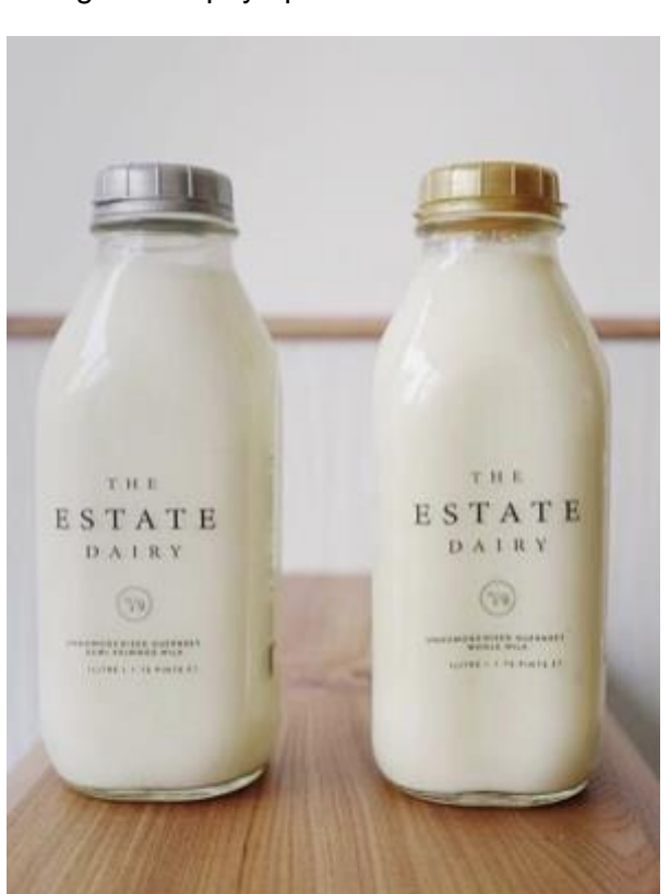
Specialist milk for coffee brand The Estate Dairy

So far the dairy sector has largely failed to profit from consumer's love affair with coffee and willingness to pay upwards of £2.50 for a latte. Only more recently has there been attempts