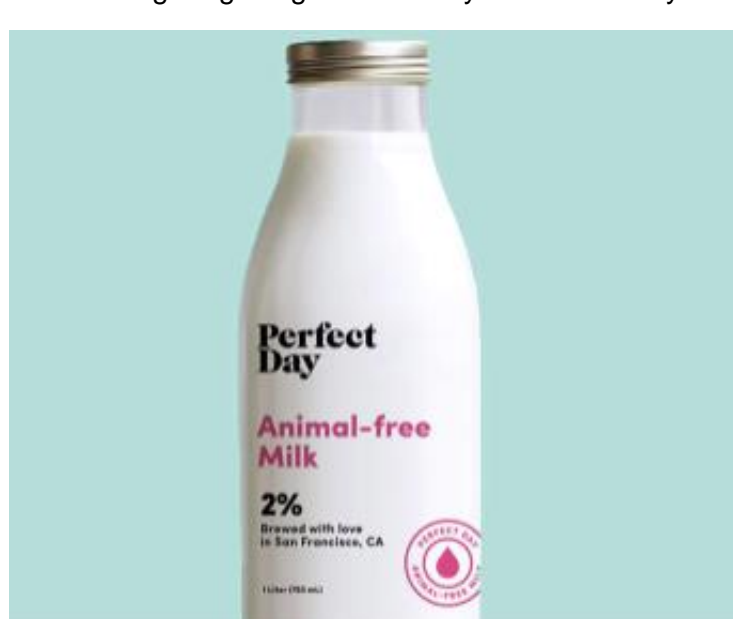
Animal-free milk developed by US-based Perfect Day

For Flore, value for dairy producers would come from re-connecting consumers with the traditional farming in their locality. "Milk production is an activity based in defined geographical areas. Food production trends don't favour Sardinia or rural Wales with high production costs and transport costs to markets. Milk is still 1,000 of different realities around the world. We need to be careful to preserve the local tradition and not just promoting something for getting more money for the industry. If we just think about feeding cows and