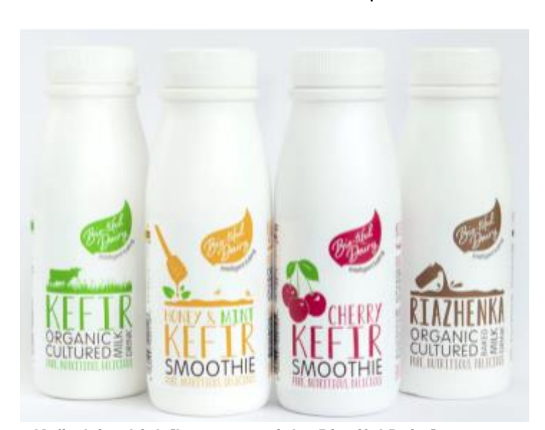
Kefir dairy drink

While the market today of consumers willing to experiment and pay more for different types of milk like Jersey, unhomogenised or regionally-specific milk may be small, milk sommelier Doug Wood said it can be grown through dairy companies focusing on the food service sector. In the UK, consumers spend £96 billion a year in cafes, canteens and restaurants. While spending on household food and non alcoholic beverages since 2013 has fallen in real terms by 3.2%, household spending on eating out has risen by 9.5%, according to Defra's food surveys<sup>25</sup>. The Scottish-based brand Graham's Dairy has had some success here with 50% of its sales of branded products like Jersey Gold Top coming through the food