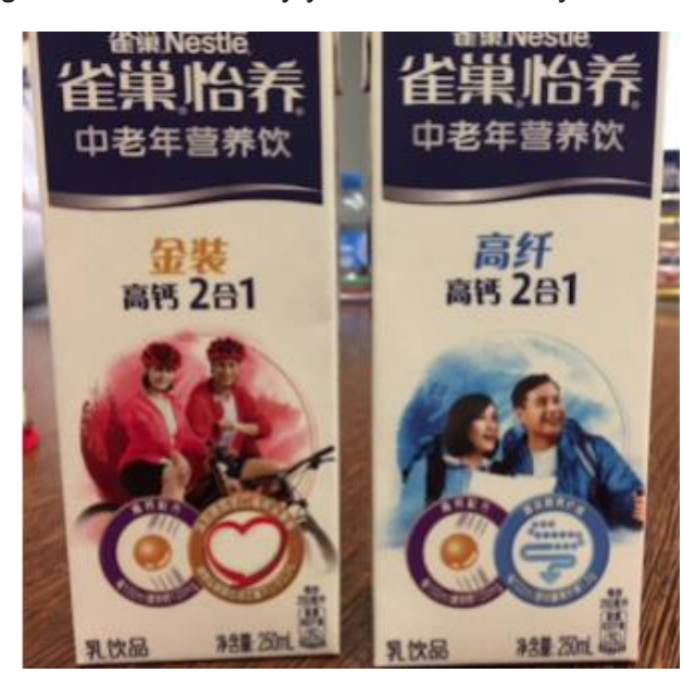
Asian-based Nestle milk brands targeting so-called 'goodlifers' who are over the age of 45 years