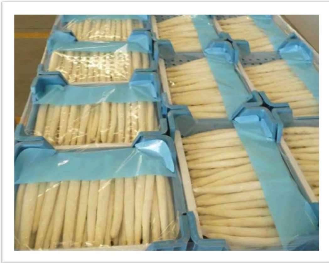
Figure 18: Photo of graded white asparagus product taken at Zandberg, Netherlands (1/5/2013)

For the European market, the typical final package is a five kg polyethylene-reinforced carton approximately 40 x 30 cm. Ten 500 grams bundles are put in the carton, usually wrapped in a perforated plastic sleeve. The bundles should be placed upright in a vertical position, one beside the other. In addition to the typical 500 gram bundles, another type of retail package in Europe is the 250 gram bunched bag.