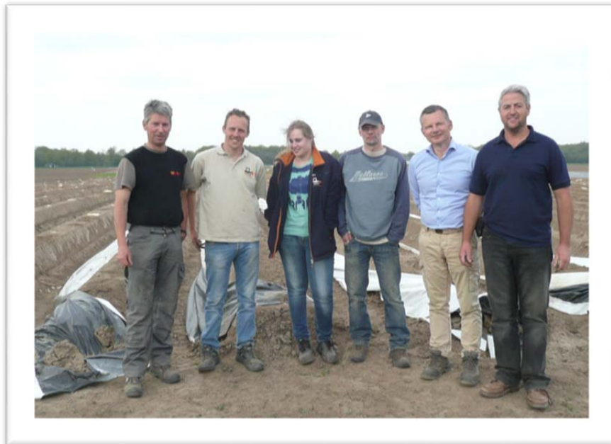
Figure 1: Photo of the author with the white asparagus trialling team at the Nunhems Research facility Nunhems.Netherlands (4/5/2013)