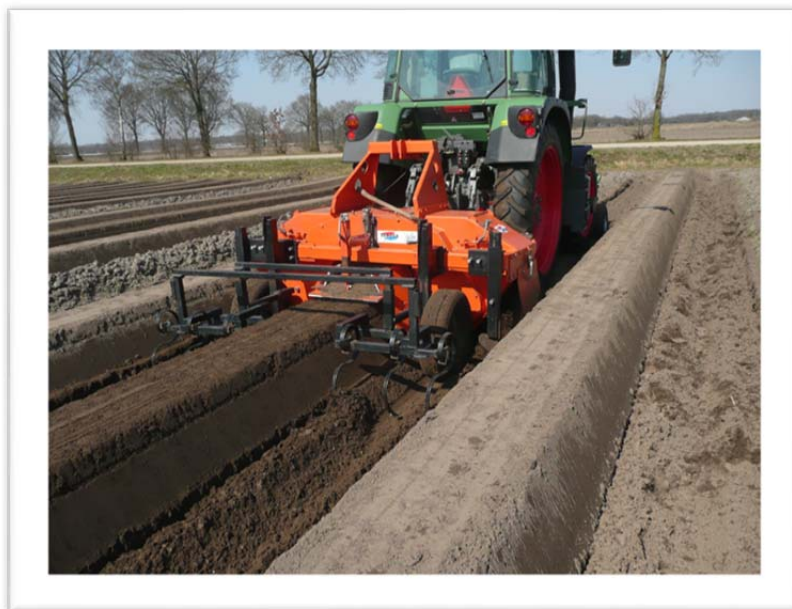
Figure 8: Photo of soil mounding at Teboza farm taken at Horst, Netherlands (3/4/2013)

tall above the soil surface. Post emergence herbicide treatments are also used during the initial establishment season along with cultivation, once the fern has reached appropriate height. The tops should be cut to the ground at the end of the first growing season (in winter). Prior to the start of the first cutting season, soil will be mounded into planting rows creating a raised bed 40 cm above the field level (ADC, 2001).