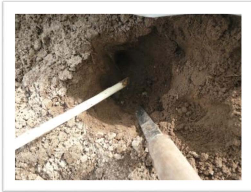
Figure 14: Photo of exposed hole created during harvesting taken at Horst, Netherlands (27/4/13)

spear is then cut. The spear is carefully removed and placed into a cutting frame. It is critical to back-fill the exposed hole with the disturbed soil otherwise the remaining spear quality is compromised.