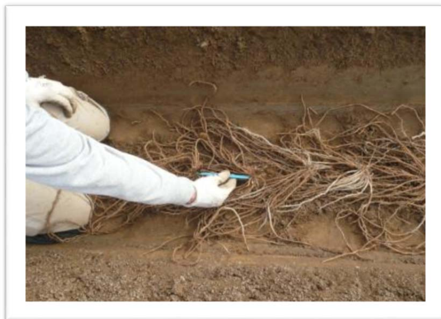
Figure 3: Photo of crown planting taken at Roermond, Netherlands (16/4/2013)

history of asparagus production. Light-textured soils are best for ease of digging. Soil pH should be 6.0-7.0. After ploughing, apply fertilizer in accordance with soil test and incorporate into the soil surface. Manure at the rate of 10-15 tonnes per hectare can be substituted for part of the chemical fertilizer if it is free of weed seeds.