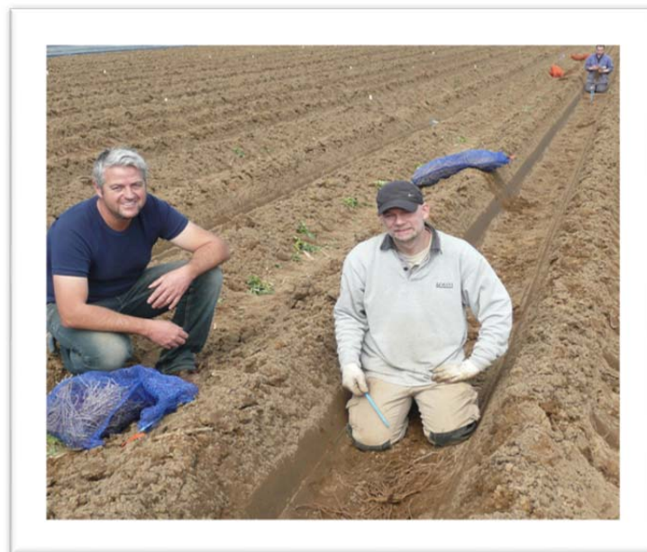
Figure 5: Photo of crown planting activity taken at Roermond Netherlands (16/4/2013)

The operation of the planting machine, a highly efficient and precise way of planting large hectares, was observed at Teboza's and Nunhems' facilities. The machine is attached to the back of the tractor and two people sit either side placing the crowns onto a wheel that rotates and holds the crowns in place. As the crowns make contact with the soil, it places them into position at the base of the prepared furrow and covers the entire crown over. Depending on the speed of the crown placers, it is possible for two people to plant between 120 – 150 crowns per minute. Subsequent irrigations should be made as needed to sustain normal growth. The crowns are then allowed to grow all year without cutting. Furrows are gradually filled in, without completely covering the growing spears, until the land is level or slightly ridged over the plant row. Plant population is 18,750 to 25,000 plants per hectare. It must be noted that crowns are not permitted to enter into Australia due to strict quarantine regulations. However, seed is permitted as long as it is certified and has all the appropriate sanitised certificates.