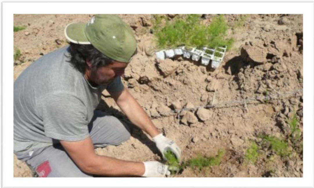
Figure 7: Photo of asparagus trial plantings taken at Seville, Spain (23/4/2013)

As observed at a farm near Seville in Spain the field is prepared by furrowing out 15-20cm deep for beds 1.5-1.8 m apart. Fertilizer is then applied prior to planting or will be mixed in the transplant water at planting. The young seedlings are transplanted with down the row spacing at 15-20 cm between plants, depending on variety. About 0.25 litres of water is applied with each plant at transplanting and the rows are wheel pressed on each side of the planted row to ensure good soil moisture contact with the transplants.