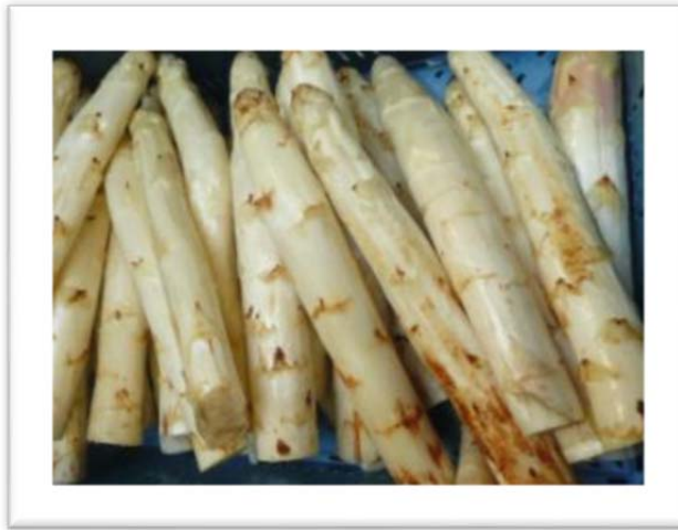
Figure 12: Photo of asparagus rust taken at Teboza Asparagus Factory (1/5/13)

Severe rust infection reduces both the weight and number of spears produced by cultivars susceptible to rust.