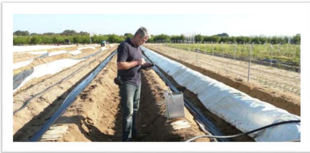
Figure 10: Photo of author assessing asparagus trial beds taken at Seville, Spain (18/4/2013)

The recording is undertaken in the field and the data is collected electronically. Potential new varieties are laid out in lots of 10, with specific numbers for identification. This coincides with the electronic data collector. At the end of the first season, all the information collated from each potential variety is assessed. This job is undertaken by the senior plant breeder and any new varieties that show poor characteristics from the assessment criteria are eliminated.