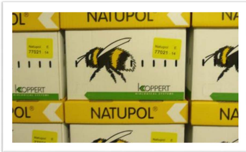
Figure 9: Photo of bee boxes waiting for collection at Mertens Warehouse at Horst.Netherlands (4/4/2013)

To guarantee that there is no cross pollination from other asparagus plants, male or female, the selected parents are grown in large tubs placed into specially constructed polyethylene covered greenhouses. In late spring, the selected parents are placed inside; one male to six females is the normal ratio. Once the male and female parents are in full flower a secondary cover is then placed over, to ensure no chance of cross pollination.