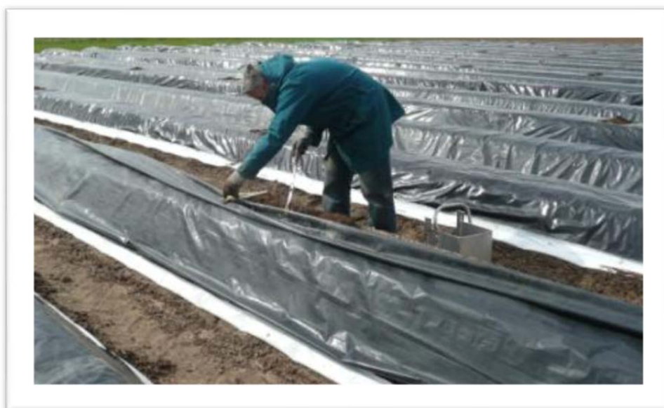
Figure 15: Photo of author participating in harvesting activity at Horst, Netherlands (27/4/13)

If it is not placed back over the remaining emerging spears, a pink or purplish hue will be imparted to the tips and upper part of the spears exposed to the sunlight. This is due to anthocyanin pigment formation. Care must also be taken not to injure the other buried spears growing from the crown. In order to harvest asparagus spears with a compact tip, they should be harvested on a daily basis.