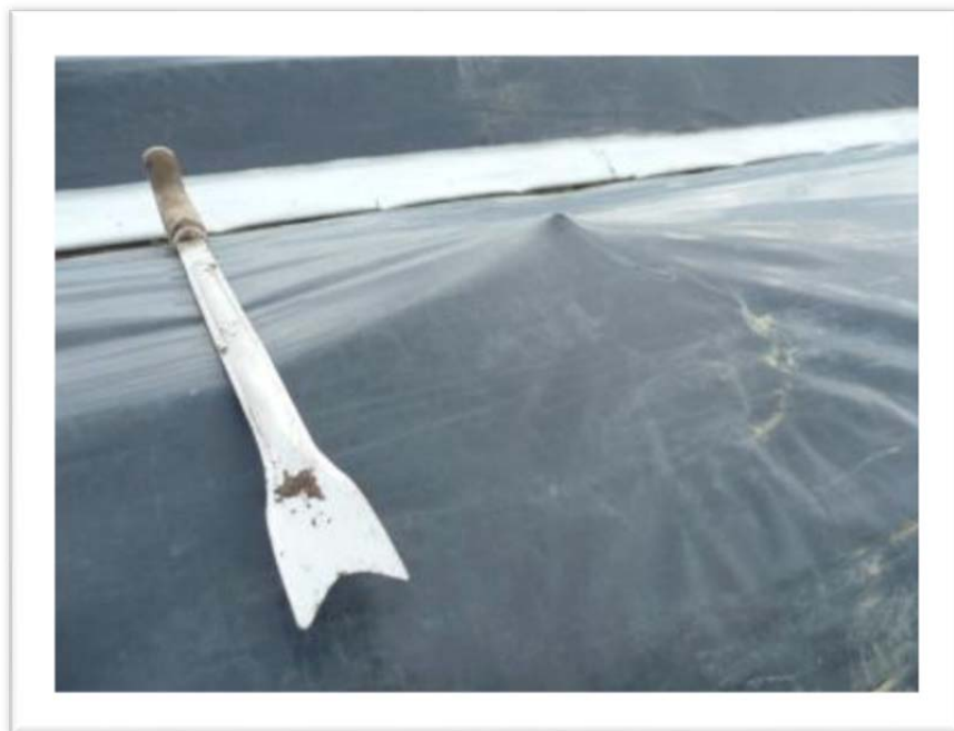
Figure 13: Photo of indent in plastic sheeting and asparagus cutting knife prior to harvesting, taken at Nunhems Research Facility at Nunhems, Netherlands (27/4/13)

Traditionally the harvest would commence in the second to third week in April in the Northern Hemisphere. The spears commence to grow and as they penetrate the top of the soil, small raised indentations can be observed along the plastic covered bed, which indicates their locations ready for harvest.