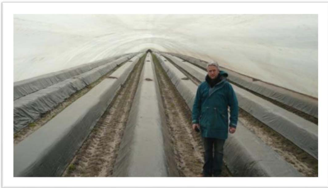
Figure 11: Photo of author examining blow tunnels at Horst, Netherlands (5/5/2013)

In late winter, the blow tunnels are placed over the asparagus fields. The dimensions of tunnels are generally 100 m x 40 m x 1.8 m high. The blow tunnels are laid out over the asparagus beds and a trench is dug around the outer edge. The soil is back-filled over the outer edge of the tunnel to secure the plastic sides. A door is then attached at one end of the tunnel. To inflate the blow tunnel a pipe is placed under the soil and is fed into the tunnel alongside the opening door. Hot air is generated by a diesel compressor to inflate the blow tunnel. The ideal air temperature is 27°C. Due to the consistent high temperature, the white asparagus is able to be harvested at least four weeks earlier than that of the mini tunnels.