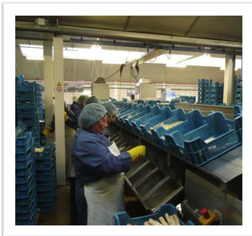
Figure 17: Photo of grading activity at Teboza grading shed at Zandberg, Netherlands (1/5/2013)

White asparagus is a high-value but very perishable product; consequently the quality requirements are very stringent. The purpose of the European standards for the fresh market is to define the quality requirements for white asparagus at the dispatching and sale point.