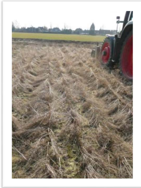
Figure 4: Photo of crown lifting taken at Teboza Farm at Helden, Netherlands (28/3/2013)

Dr Ben Silvertand of Nunhems (March 2013) advised that there are three specific grades of crowns: