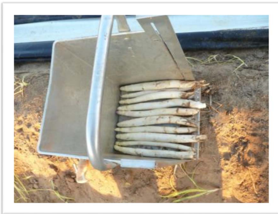
Figure 16 : Photo of freshly harvested white asparagus spears in a collection box at Seville, Spain (20/4/2013)

Collection of the spears is undertaken by the harvester, as the harvester cuts the individual spears to a standard length of 24 cm, it is then placed into a collection box; all spears are orientated in the same direction. When the box is full they are cut with an asparagus saw, which removes 2 cm from the ends of the spear. This leaves a spear length of 22 cm, which is a European standard for white asparagus.