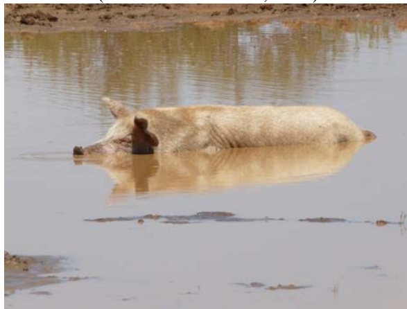
Pig wallowing in extreme heat, Northern Cape, South Africa