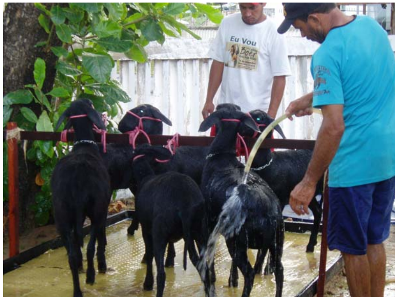
Sheep get cleaned up for the show in Joao Pessoa, Brazil.

This was an important country to visit, since the pressures on Brazil's farmers to produce meat in a more sustainable way are there for all to see. Brazil was last into the 2008 recession, and the first country to come out of it, and presents a great case study in agricultural terms. The country is under intense worldwide pressure over deforestation, and the government clearly believes alternatives to beef production need to be secured to find a reliable future for Brazilian farmers.