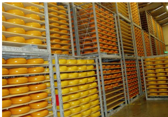
Amalthea Cheese plant storage, Holland.

The Netherlands has a strong dairy goat industry numbering a staggering 300,000 head. It has access to European markets on its doorstep, and it is relatively easy to transport milk to these markets. The Dutch have always reared more male dairy kids than we do in the UK, and a new co-operative membership requirement to prove that male kids are being reared and not put down at birth, meant Holland was a great place to visit to see the enterprises in place for rearing males.