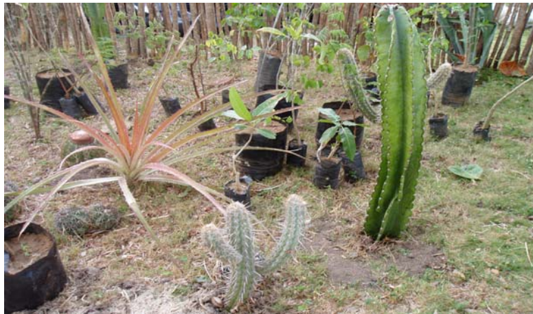
Examples of fodder that Brazilian goats like to sink their teeth into