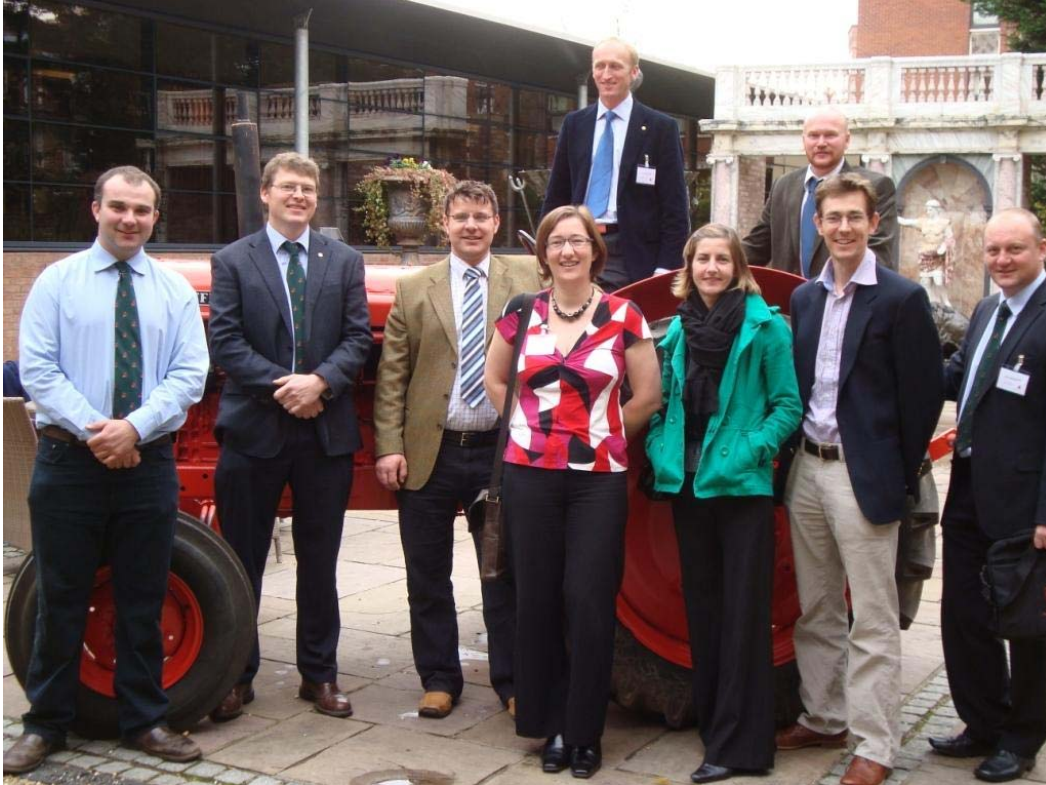
Myself and some fellow 2009 Scholars at the 2009 Nuffield Winter Conference.

My aim when applying for a Nuffield Scholarship was to gain a clear idea of the role meat-goat farming might play in the future of agriculture, and which management and marketing systems looked best placed to shape the success stories of tomorrow. I have achieved what I set out to do, and now find this study influencing every aspect of my business and how I run it.