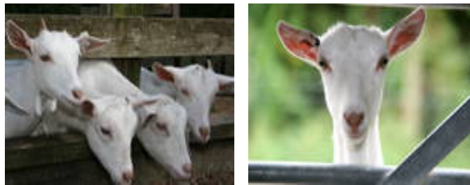
Some of the kids for visitors to feed at Longdown Activity Farm

Before going to Bryan Pass's, kids are all de-horned, vaccinated, tagged and castrated. Tim then sells them on for £15/head at a fortnight old.