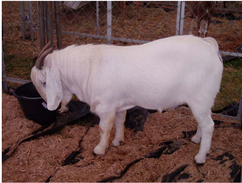
A reluctant show man – a Savannah buck in Brazil.