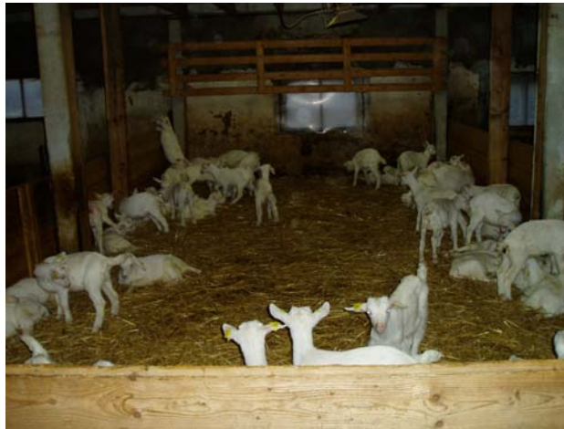
Above: Billy dairy kids at the van Dam rearing unit. Below: Automatic milk feeding machines at the van Dam rearing unit.