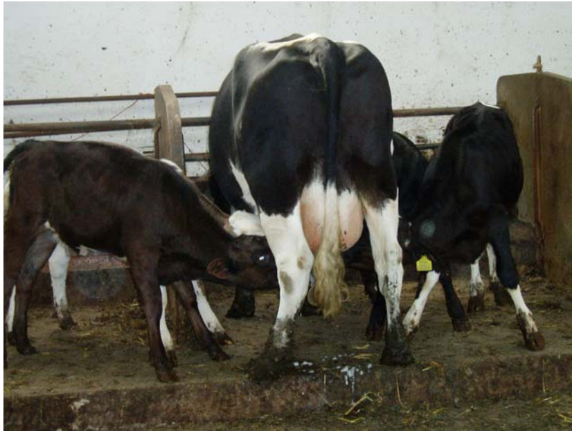
Cow with her four foster calves at Buck Crag

There is no reason why a similar system could not be used with dairy goats, putting surplus billy kids on them. On consultation with others in the industry, several thoughts presented themselves: