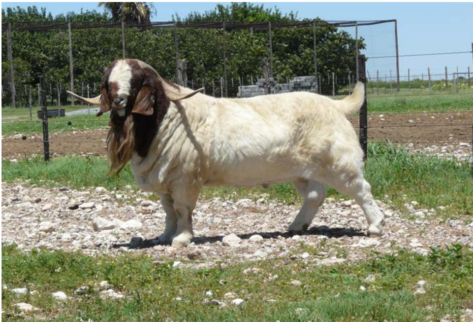
Champion Boer male at Lucas Berger's farm, Northern Cape.

Their business thrives on a strong internal network of breed sales, where the best bucks fetch big bucks. Males like the one in the picture below can fetch up to 36,000 Rand – about £3,000.