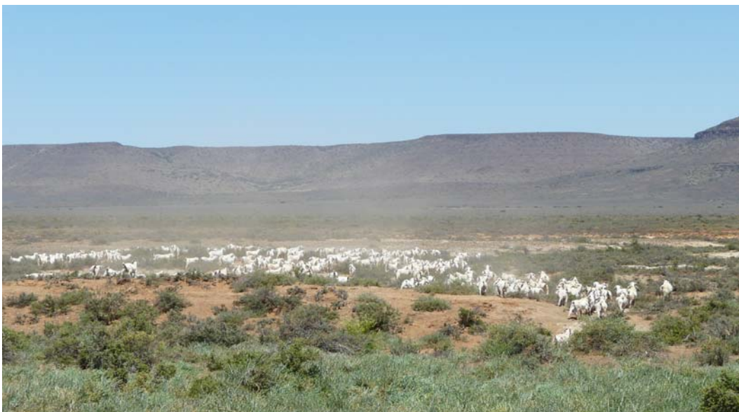
Savannahs head back out onto the dusty Veldt, South Africa.

In some parts of the world herds of goats have eaten their way into trouble, where large numbers overgrazed infertile areas and led to desertification of fragile landscapes. But managed extensively and carefully, there seems to be a rising enthusiasm for using goats as a pasture-management tool. As pressure mounts on the farming community worldwide to focus on sustainability, goats surely have a role to play in our search for low-input livestock systems with minimal environmental impact.