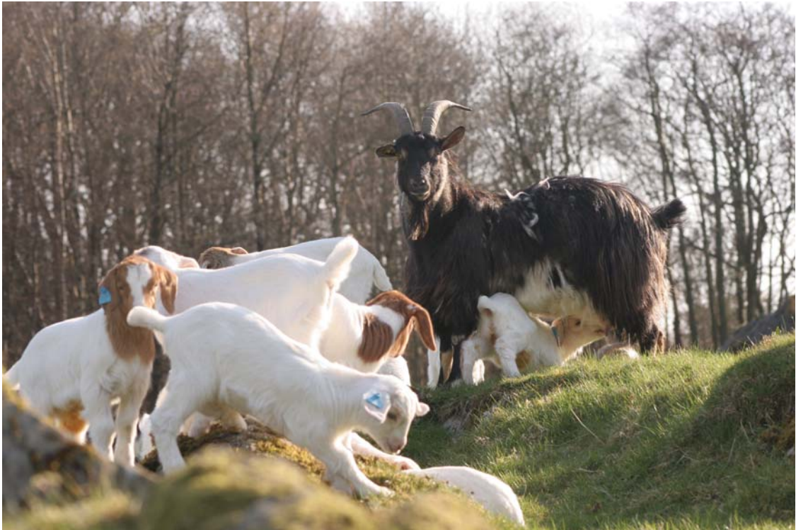
Cashmere female with Boer cross offspring on Lake District Fell

In the following five chapters of this report I have summarised what I discovered on my Nuffield Scholarship. Although each chapter deals with a distinct subject, none should be seen as existing in complete isolation, as invariably issues overlap.