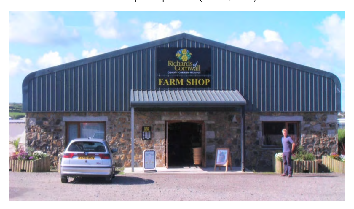
Locally Produced Product Farm Shop in Cornwall, UK.

A recent article published in Food Week reported the concerns of Western Australian fruit and vegetable growers who claim that rising production costs will limit their capacity to produce enough food for the state by 2020 (Food Week Online, 2008). Other research again suggests that local production does not necessarily guarantee fewer carbon emissions than imported products (Neville, 2008).