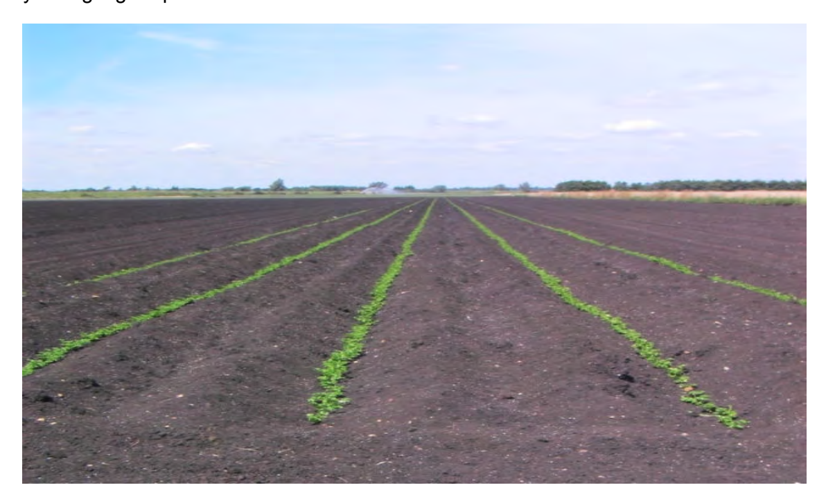
Celery produced 'Heritage Style' at G's Marketing in the UK

this age-old practice would normally be perceived as uneconomical, but retailers have seen the potential to market such products to consumers as "backyard grown", yielding higher prices at the checkout.