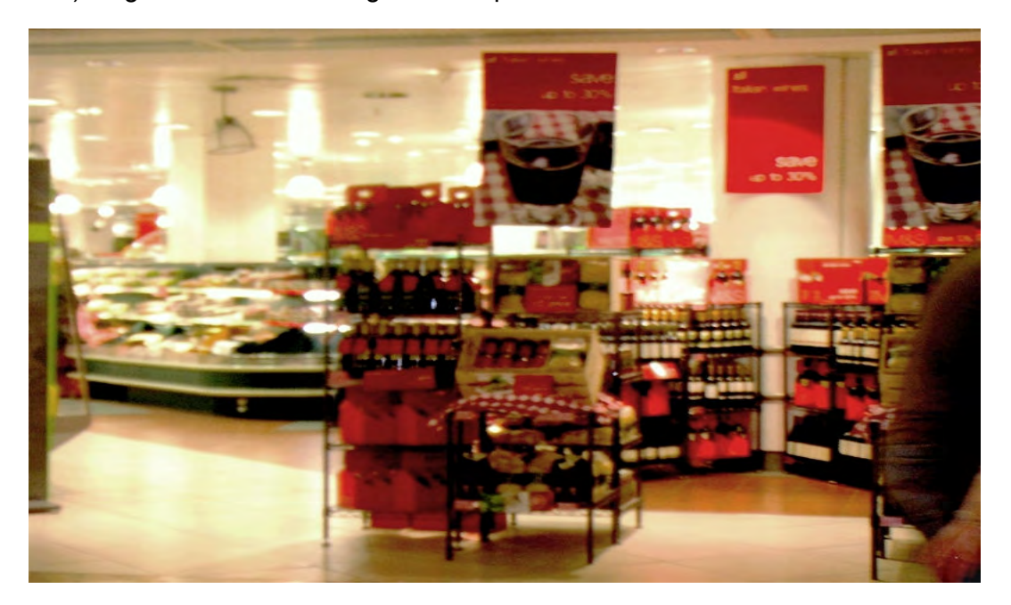
Plan-o-gram of a Marks and Spencer Store in the UK of their gourmet deli department

bakery and other areas devoted to perishable foods. The supermarket has also increased its product range to match the consumer purchasing behaviour at its stores based on an understanding of the demographics in each store location. Expansion of the gourmet food department represents an attempt to compete with speciality stores. Improved, vibrant product signage and reduced 'lounge' (display unit) heights are also creating a more open feel in-store.