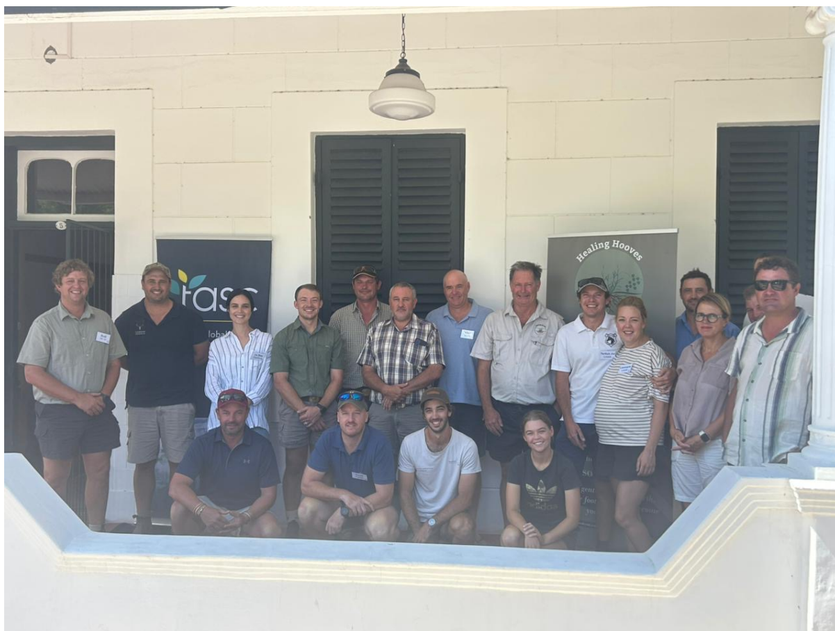
Figure 2. Participants of the Regenerative Land Management course, South Africa