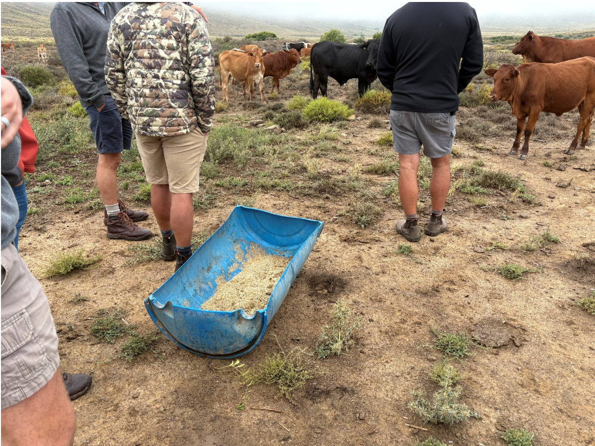
Figure 8. Half cut drum used as loose lick container, Roland Kroon's property, South Africa.

Many of the supplements are delivered via loose licks however a well-designed system could also deliver via water dosing. Urea based products can be fatal when wet and must be appropriately managed. Every property visited had different systems ranging from half cut drums to purpose built covered trailers to allow for the constant moving. When grazing both sheep and cattle consideration must also be given to their different needs. One solution was to have tubs at different heights, high for cattle access only, low with a guard rail to allow sheep only access.