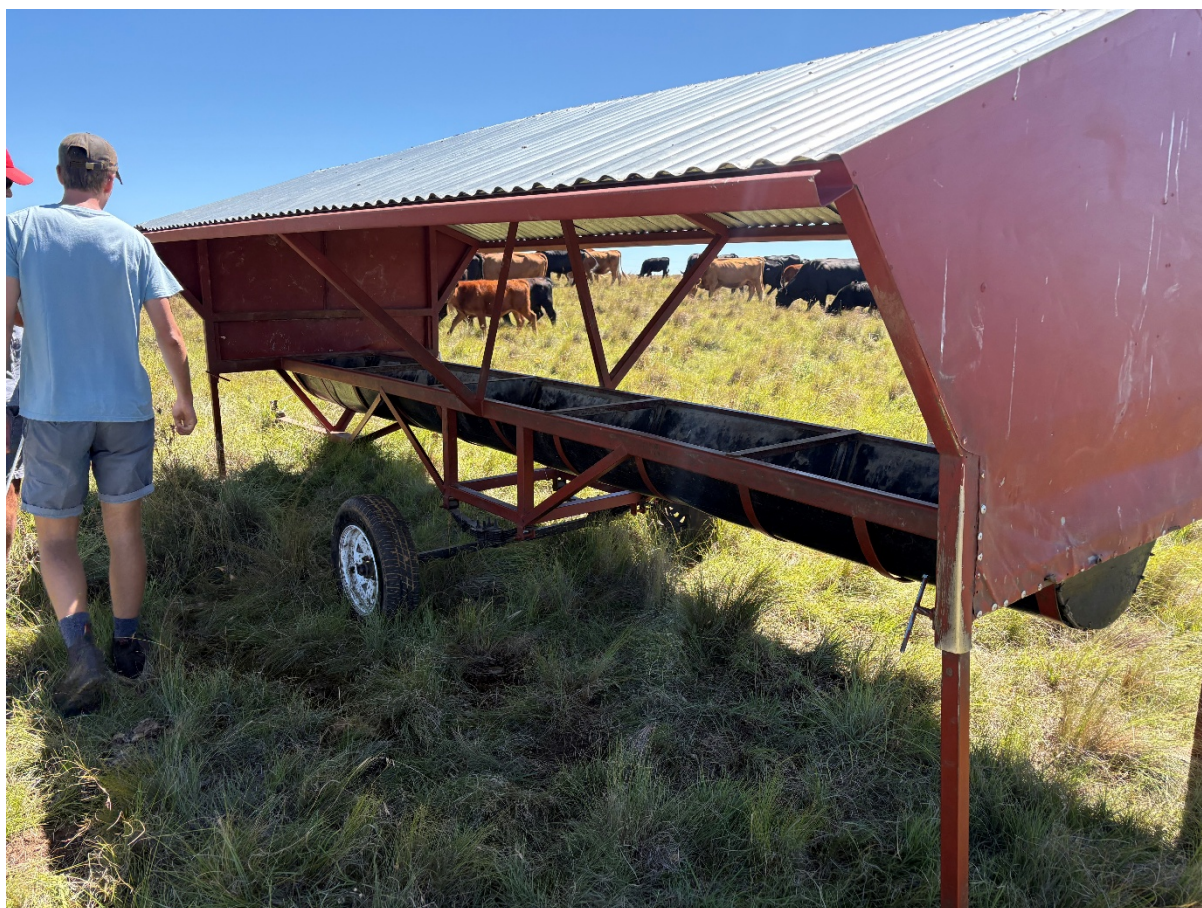
Figure 10. Covered loose lick trailer, Rowan Stretton's property, South Africa