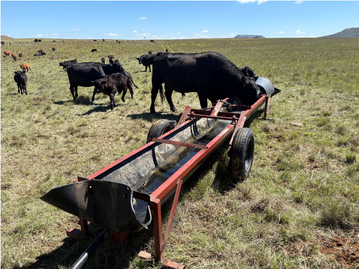
Figure 7. Portable water trough, Rowan Stretton's property

When considering water infrastructure, the overwhelming advice is to ensure water can be delivered at a high enough flow rate. Trough size and designs vary however when watering large mobs it is always flow rate into the trough that is considered the most important. To that point the advice has been to, whenever possible, design a system that has greater capability than just what is needed to service the current demand. If demand currently dictates using 50mm pipe, then consider 63mm pipe instead.