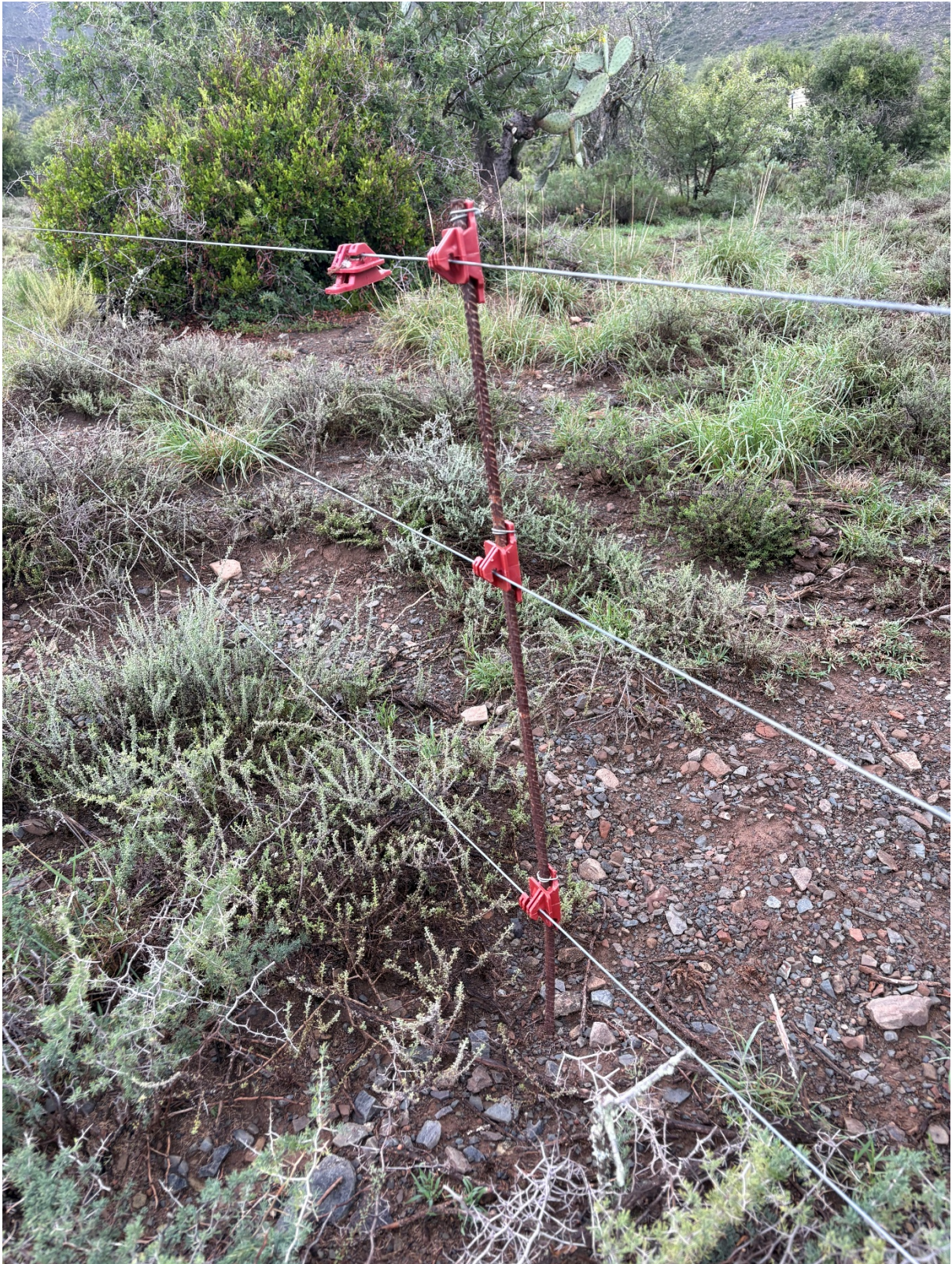
Figure 3. Permanent electric fence in use on James Brodie's property, South Africa