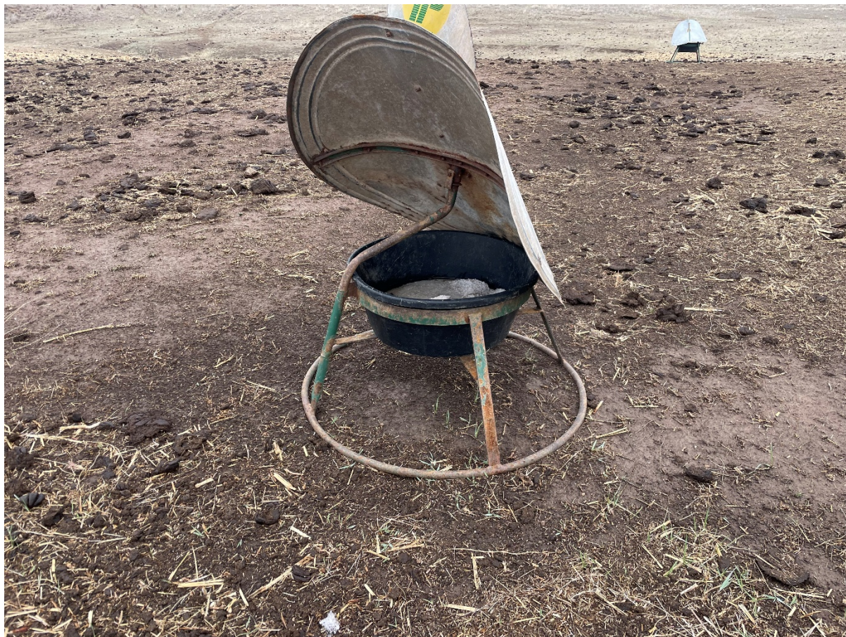
Figure 9. Sheltered loose lick container with self-pivoting cover, Laura Burandt's property, US.