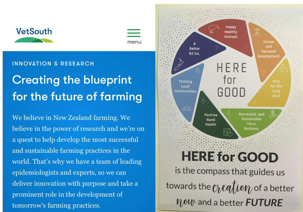
Figure 2: VetSouth vision for farming and veterinary services ( www.vetsouth.co.nz )