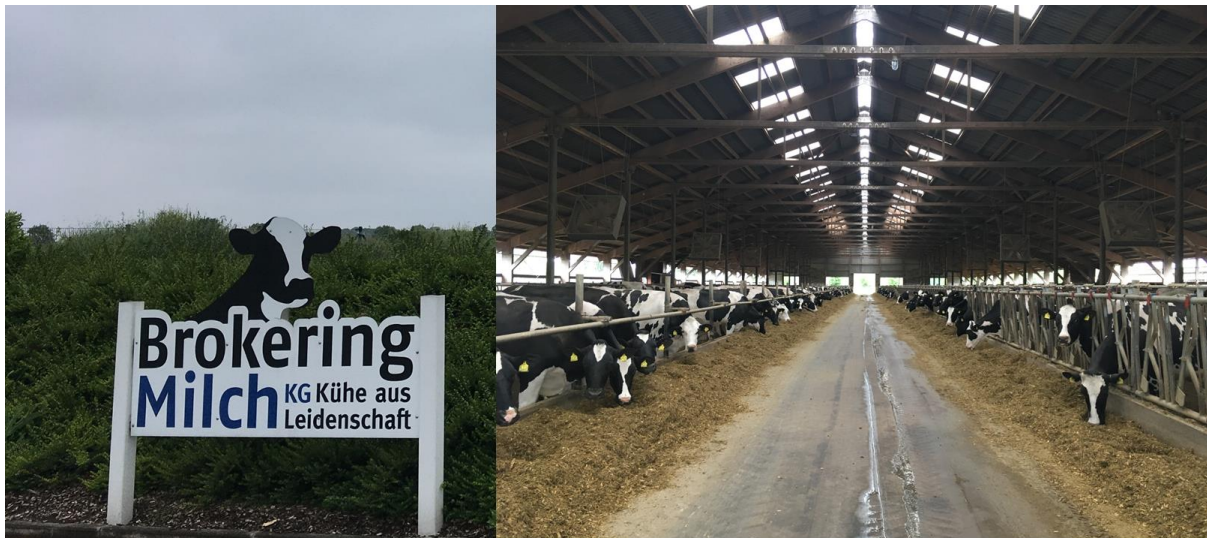
Figure 3: Brokering Milch, a German dairy farm

In Germany, at Brokering Milch, a 550-cow dairy farm, I saw a high level of awareness and attention to good management practices including following treatment protocols (Figure 3). The health of cows and calves was monitored closely, testing colostrum with strict hygiene for milk replacer. The farm has ambitions: taking the initiative, they are working with a local group of young farmers to develop an employers' group programme to train new farm employees with the skills needed.