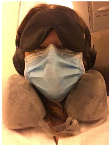
Travelling to New Zealand (February 2020)

All these themes feature in my study, where the challenge is to build resilience through animal health and welfare and animal medicines best practice. It reminds me every single day of what needs to be done and I've had the opportunity to share my experiences and insights with policy makers and industry to support the development of legislation in the form of the Agriculture Bill and in the case of England, the Animal Health and Welfare Pathway – as a vehicle to incentivise best practice and improvements in animal health and welfare. Nuffield is not a 'one and done' and the lessons learned, and experiences shared, have a lifetime of mileage and memories.