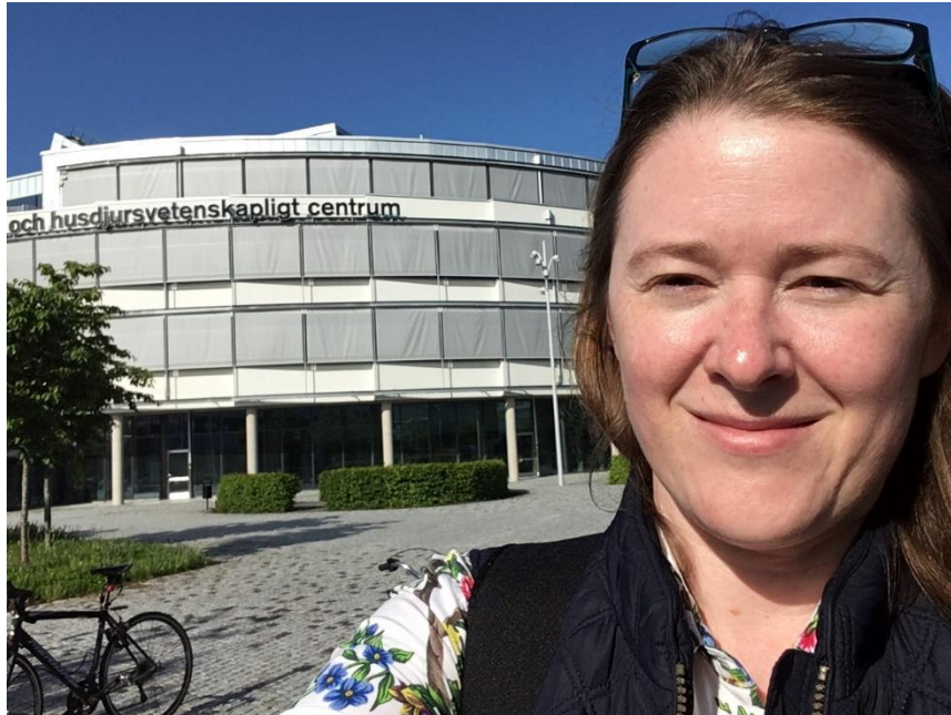
Figure 1: a visit to SLU to discuss the role of the vet and preventative herd health planning

which drives a reactive mindset, rather than a strategic approach. A proposed preventative health model includes taking both a farmer and animal centred approach e.g. using Cow Signals or an ‘ask the cow’ approach with animal-based measurements alongside a discussion with the farmer using available data.