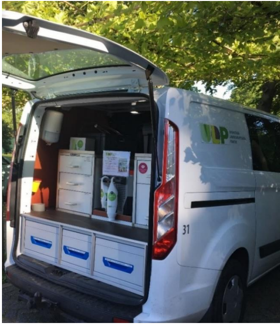
Figure 9: Utrecht University farm vet practice - spotless vehicle for farm visits

Norway has much less endemic infectious disease pressures and a different starting point compared to the UK. It is easier to control local outbreaks of disease due to large geographic separation and low animal population. Nevertheless, there is very little movement of live animals into the country, and local movement restrictions to within certain districts or directly to slaughter, which naturally decreases the spread of disease. Vets in Norway have a fundamental awareness of biosecurity. Farms have a biosecurity area at the point of entry, barriers in place and dedicated boots and overalls.