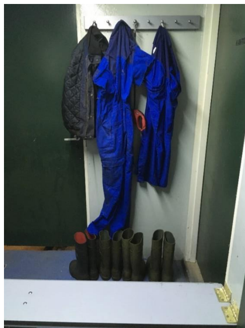
Figure 10: overalls and boots available on farm for vet visits