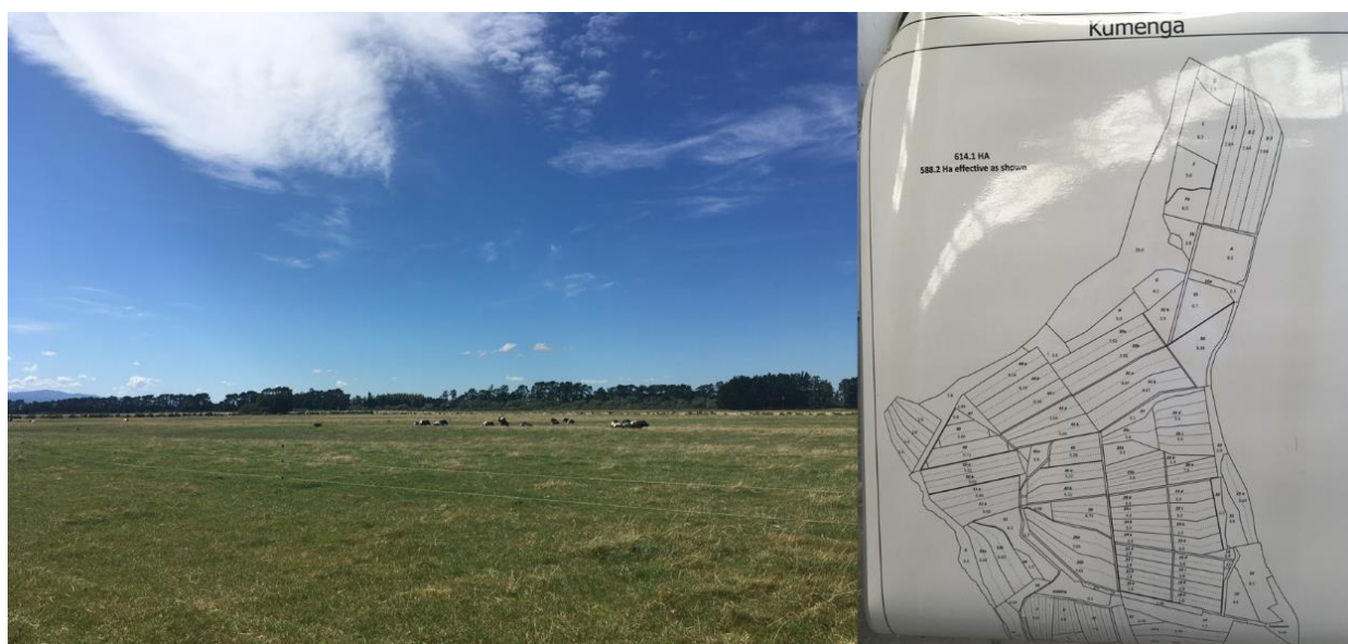
Figure 13: Kumenga Farm, New Zealand where I attended a parasite resistance workshop. Pasture blocks (shown on right hand side) - pasture management is an important part of parasite control.

The 540-hectare, 29,000 sheep and 1,500 cattle Kumenga Farm, on New Zealand's North Island is taking part in a landscape level sheep parasite resistance project. Farmed by Mike McCreary and Liz Casey, their ambition to be one of the most efficient lamb finishing farms in the world. The project, supported by Silver Fern Farms, PGGW Wrightson and Beef + Lamb NZ, is facilitated and has the assistance of local vets. It takes advantage of the breeder-finisher (and processor) relationship to reach out across the supply chain and develop a landscape level approach to worm control and resistance management. The project aims to develop a store stock protocol that manages drench resistance, shows improvements in lamb performance, actively involve breeders to develop their awareness of impacts on the finishing farm, introduces susceptible worm genetics and shows improvements in drench efficacy testing. A monitoring plan and decision-making process will be developed on farm, considering costs involved and incentives needed.