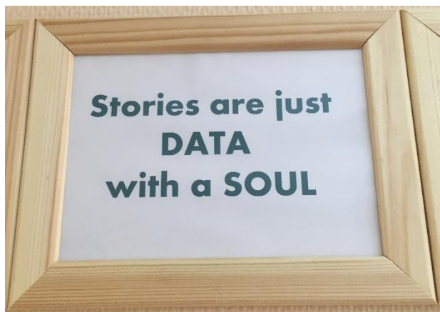
Figure 4: from the office of Dr Fernanda Dorea, SVA

A theme that permeated almost every discussion I had was that of data and how to make it useful. The inescapable reality is that we need to get to grips with and harness true value from data, for the individual farm and the national interest (Figure 4).