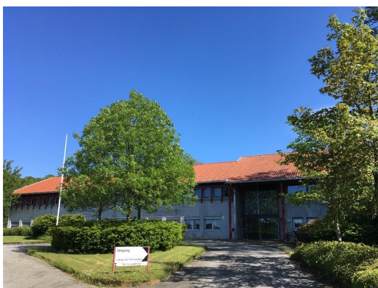
Figure 5: Rural post-mortem facilities at NMBU, Norway

Dr Clare Phythian, a sheep vet in Norway explained that post-mortem facilities need to be accessible or located near farmers, as without them less samples are submitted. The post-mortem lab she works in is subsidised and carries out a full range of services for local farmers (Figure 5).